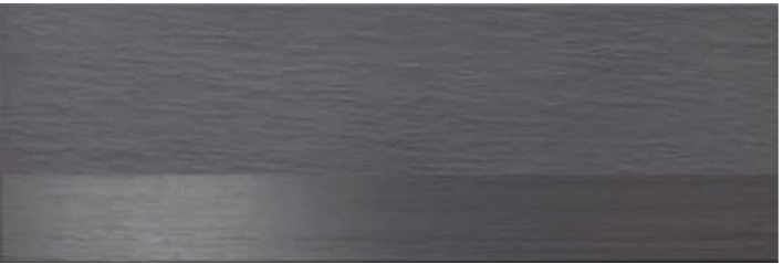
* 24802 STONEWOOD ANTHRACITE/30,5X93,5/R Q2 (30,5x93,5 cm) (12 1/16x36 13/16") 4 patterns