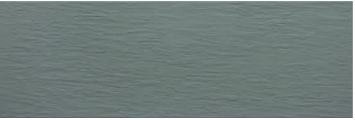
* 24803 STONEWOOD GREEN/30,5X93,5/R Q2 (30,5x93,5 cm) (12 1/16x36 13/16") 4 patterns