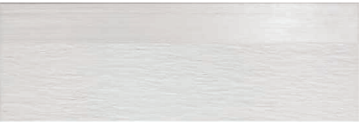
* 24806 STONEWOOD WHITE/30,5X93,5/R Q2 (30,5x93,5 cm) (12 1/16x36 13/16") 4 patterns