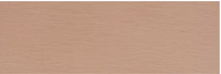
* 24804 STONEWOOD LEATHER/30,5X93,5/R Q2 (30,5x93,5 cm) (12 1/16x36 13/16") 4 patterns