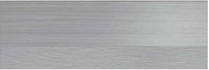
* 24805 STONEWOOD GREY/30,5X93,5/R Q2 (30,5x93,5 cm) (12 1/16x36 13/16") 4 patterns