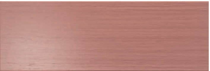
* 24807 STONEWOOD CLAY/30,5X93,5/R Q2 (30,5x93,5 cm) (12 1/16x36 13/16") 4 patterns